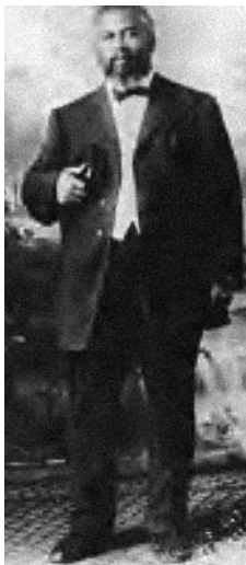
William J. Seymour

Night after night, week after week, month after month,